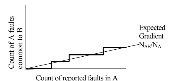
Fig. 1 – Illustration of constant proportions for an FT-node AB as execution time accumulates

5.3.1 U-plots. In the earlier work [12] on prediction analysis, u-plots were used to check for consistent differences between the sequence of functions F^{\wedge}_{i}(t_{i}) (the predictions) and t_{i} (the actual values). The sequence of numbers u_{i} were calculated as